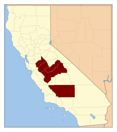
Figure 3: Location of the five leading almond producing counties in California [11]

and warmer temperatures at bloom have also contributed to the popularity of almonds in the San Joaquin Valley<sup>[4]</sup>.