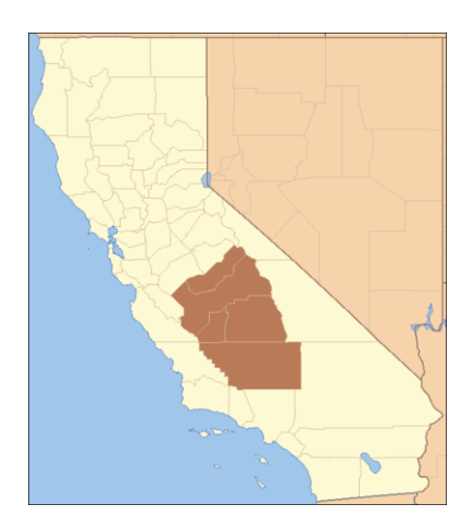
Figure 3: Location of the five leading pistachio producing counties in California [7]

More than 98% of all pistachios produced in the U.S. are gown in California, with most of the remainder being harvested in New Mexico and Arizona <sup>[7]</sup>. California pistachios are predominantly grown in the southern San Joaquin Valley (Figure 3), with the five leading counties, namely Kern, Madera, Fresno, Kings and Tulare, accounting for 96% of the production. Kern county alone accounted for 42% of the production in 2012 <sup>[7]</sup>. In 2012, about 25% of the world's pistachios were produced in California, making the U.S. the second largest pistachio producer behind Iran, where roughly half of the world's pistachios were harvested <sup>[3, 7]</sup>